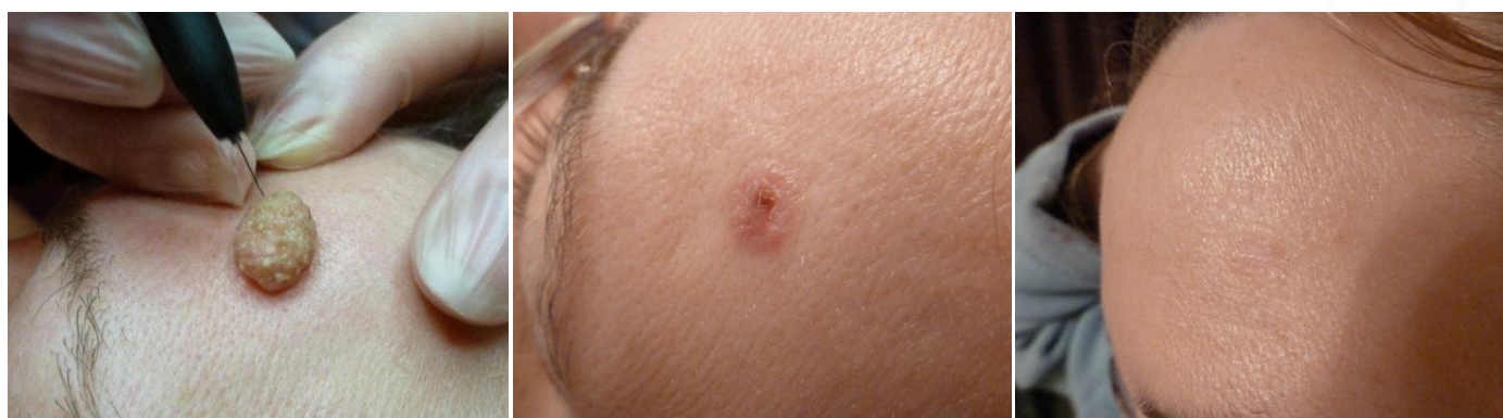
Hairy mole before treatment

A mole itself is easily treated but rather than 'removing' we 'visibly reduce the appearance' of the mole. A number of techniques are taught on the Sterex courses, each extremely successful and all using diathermy (AC). The first treatment will visibly reduce the mole by up to three quarters of its size and then a follow up treatment can smooth it so that it is flat to the skin. The colour can never be guaranteed to exactly match the surrounding skin but if the mole is much darker the remaining skin, following treatment, will almost certainly be lighter.